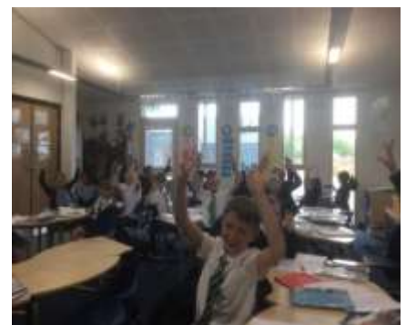
Yr 4 enjoying an 'Active Pit Stop'

It was great to see the teachers planning and delivering active lessons and children having 30 second Active Pit Stops in their learning just to help them refresh and refocus in their learning!